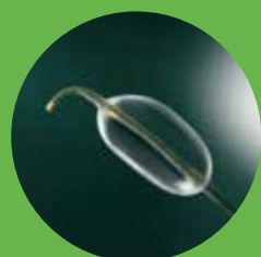
Copernic 2L Double lumen balloon microcatheter