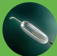
Eclipse 2L Double lumen balloon microcatheter